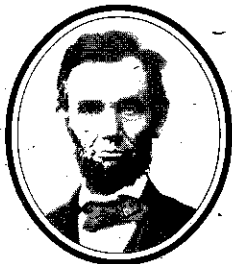
died April 15, 1865

During February, a day is set aside that is known as "President's Day." This is appropriate since two of our greatest presidents were born in February. Abraham Lincoln, our 16 th president, was born on February 12, 1809, and George Washington, our first president and the father of our country, on February 22, 1732.