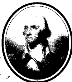
died Dec 14, 1799

This is a good time to review our history in order to understand our times. Any thinking person would ponder the difference in our citizenry today and in earlier years. Frankly, we have witnessed a nation sowing to the wind and now reaping a whirlwind. We are witnessing with our own eyes the paganization of America.