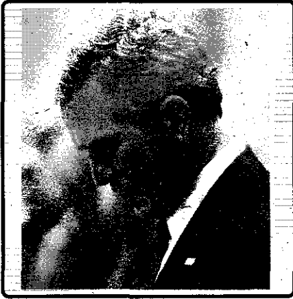
George W. Bush 43rd President United States of America

"God forbid that I should sin against the Lord in ceasing to pray for you." 1 Samuel 12:23b