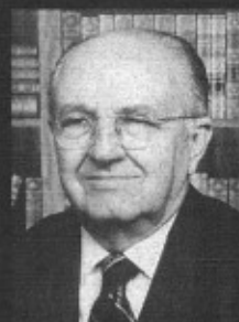
Dr. Henry Madison Morris

"absent from the body, present with the Lord" 2 Corinthians 5:8