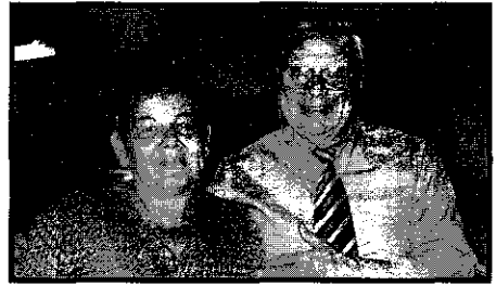
God answered her prayer

seminar and their workbooks were provided by their brothers and sisters in the United States love them, faces light up with gratitude and understanding.