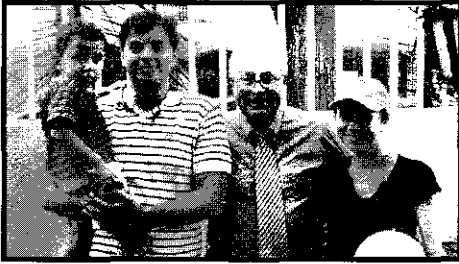
New converts in Caracas