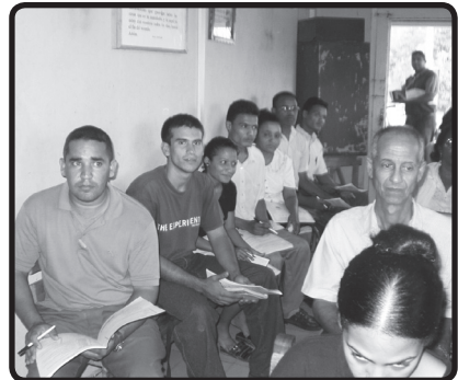
CUBAN UNIVERSITY STUDENTS CONTINUE TO TEACH PRAYER SEMINARS USING THE SPANISH PRAYER SEMINAR WORKBOOK

After fifty years, returning will allow us to celebrate the goodness of our God.