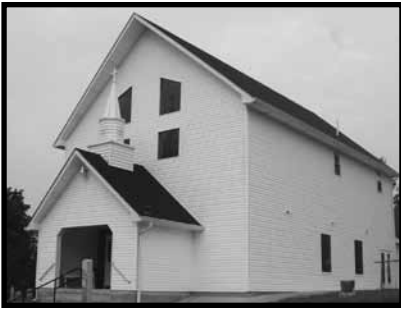
The Kerby Knob Church house