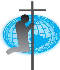
JGHM LOGO: A WORLD, A CROSS, AND A PRAYER WARRIOR

When sickness strikes, the first thing we should do is to make sure that we have no unconfessed sin in our life. Then we should ask the Lord to work out His purpose in the illness and to heal us. After that it is proper to resort to a physician and to the use of medicine, but we must be careful that our trust is in the Lord and not in the means that He uses (2 Chronicles 16:12). All healing is from the Lord, whether miraculous or ordinary. If in any particular case He does not choose to heal, then He will give grace for suffering or for dying. Ordinarily we do not get dying grace until we need it.