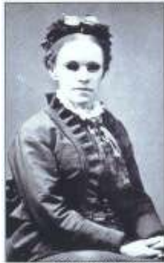
Fanny Crosby (1820-1915)

Born: March 24, 1820, Putnam County, New York.