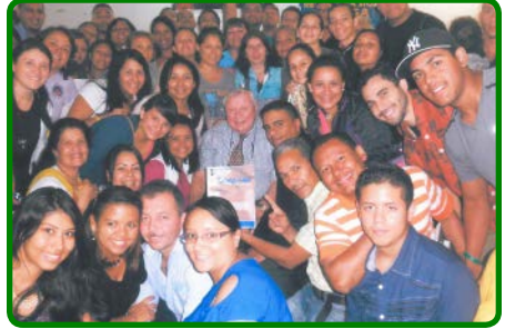
BLANKETTING VENEZUELA SINCE 1992