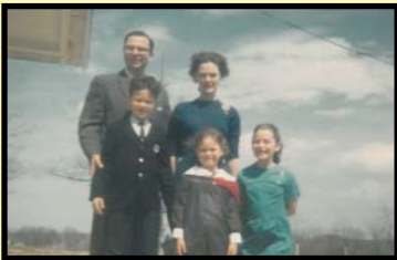
KERBY KNOB (KY) EASTER 1967