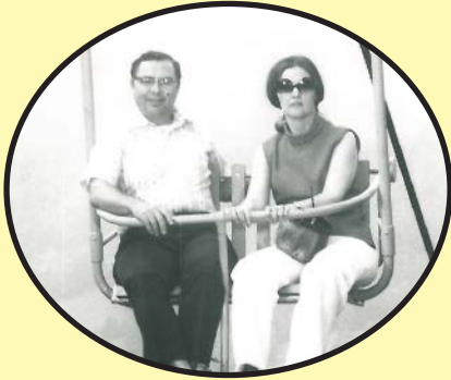
TAKING A BREAK IN SMOKIES (TN)