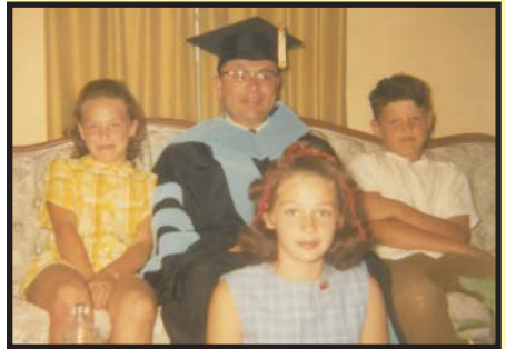
DAD BECOMES "DR." DAD--1970